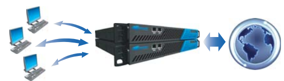
Clients Inside Organization Barracuda Spyware Firewalls Internet Active/Passive Failover Configuration